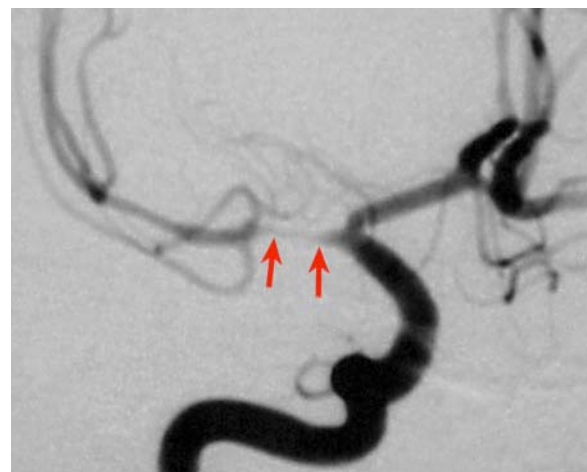
Figure 2. Angiogram shows a narrowing of the middle cerebral artery (red arrows) caused by atherosclerotic plaque.